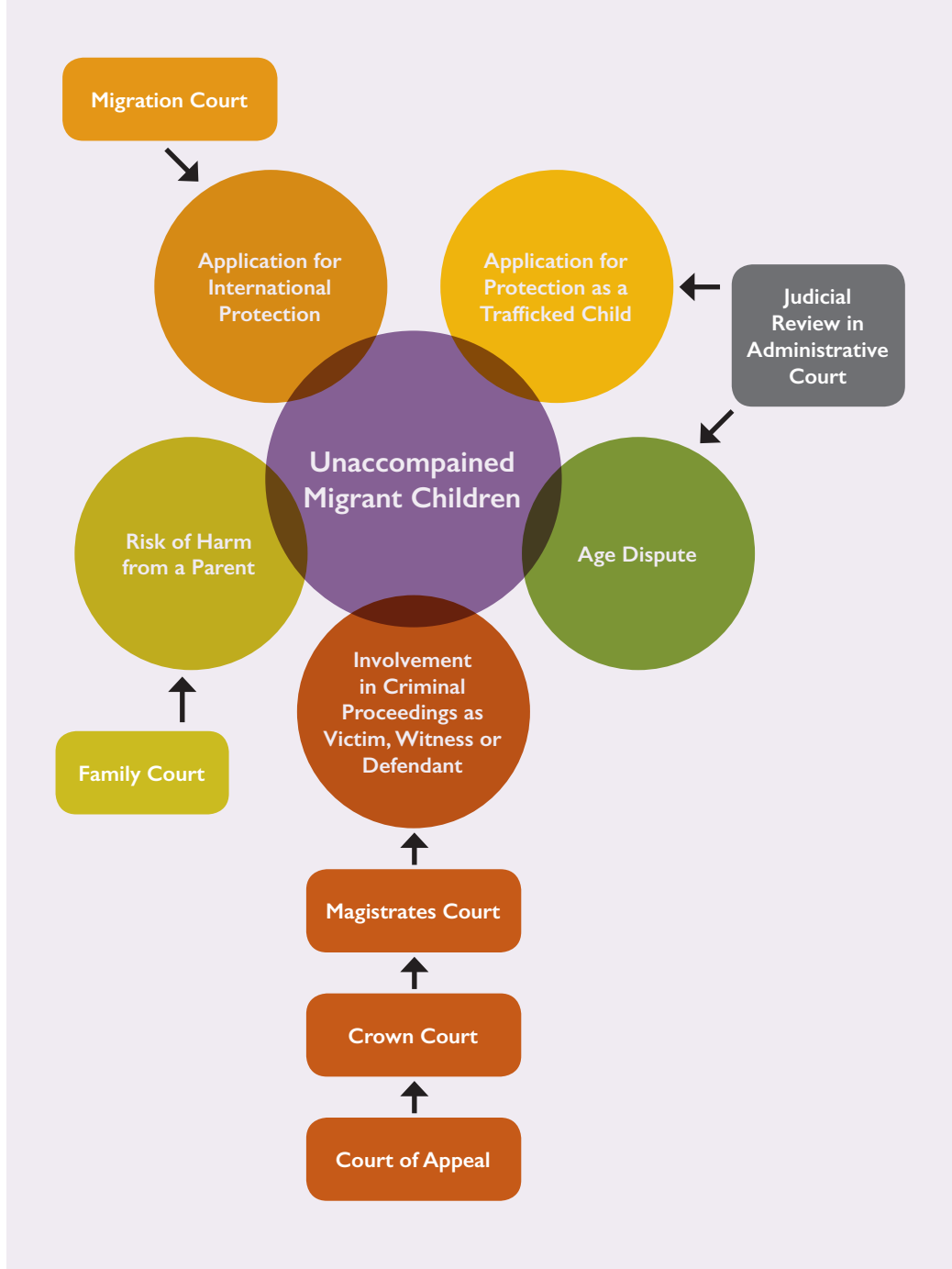
Figure 1 : An unaccompanied migrant child's possible engagement with multiple courts and tribunals

At the same time, he or she may have been refused asylum or other international protection and be appealing against that decision. Some unaccompanied migrant children may also be seeking compensation from the relevant court or tribunal for false imprisonment, assault or exploitation as a victim of human trafficking.